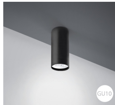
S-POT HOME ceiling designed by TI Lighting LAB

Ceiling lamp with dimensions Ø5,4cm H15cm, ready for GU10 light source. DOWN light emission.